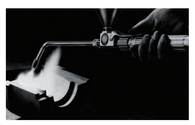
Fusewelder™ Torch spraying Colmonoy 227 on glass container moulds